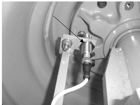
Figure 2—Ground speed sensor on SR models.

To order the sensor or if you have any problems or questions with this installation, call Bucyrus Equipment Co. Inc. at 800-330-0867.